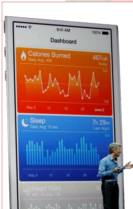
Health app dashboard on display.

identified by New Nutrition Business , a leading publication from the Centre for Food & Health Studies based in London, key categories such as Naturally Functioning Protein and Energy all rank high.